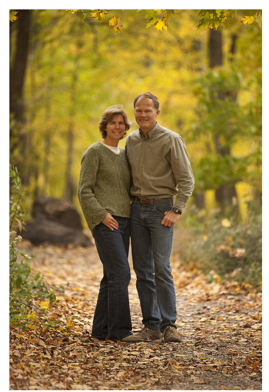
holiday season and throughout the New Year!

May the Prince of Peace, the Lord of Lords, the Everlasting Father watch over you this