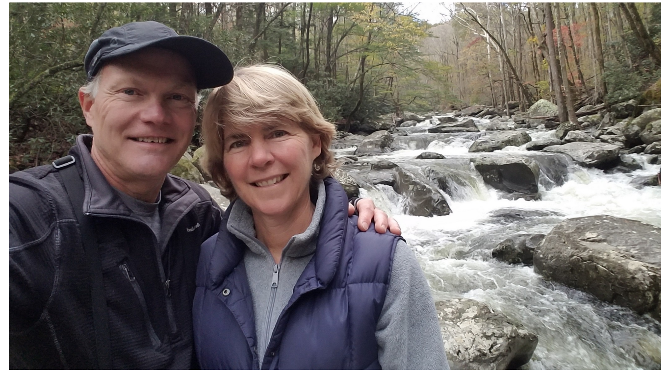
A great big greeting to all of our friends & family!

The Covid pandemic has made 2020 a challenging year. I'm sure, like you and your family, we have all been both careful in our interactions with others, but also trying to live life as normally as possible.